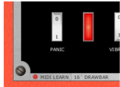
MIDI learning the 16' drawbar

When the MIDI learn status LED is no longer lit up you are ready. You will have to repeat these steps for each control you want Combo Model V to learn.