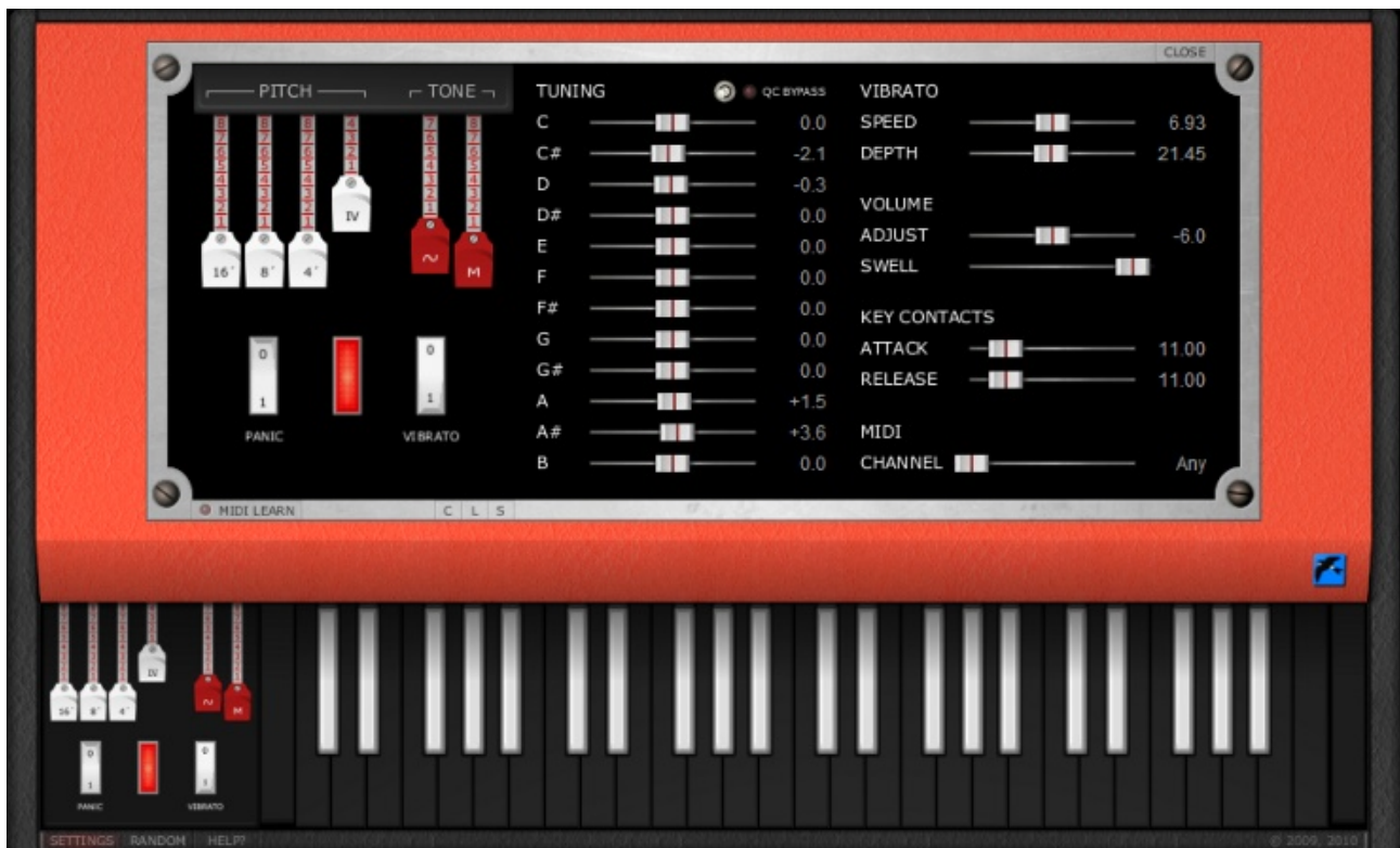
The settings window on top of the main view

To close the settings window again, left-click on the small button labelled Close in the upper right corner of the window. However, you don't have to close the settings window; by leaving it open you will have access to the settings at all times. If you save your project containing Combo Model V with the settings window open, the next time you load the project the settings window will still be open.